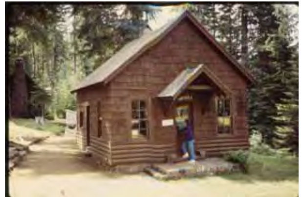
Clackamas Lake Historic Ranger Station office and now burned protective assistant cabin or "Honeymoon Cabin" visible behind it in this photograph.