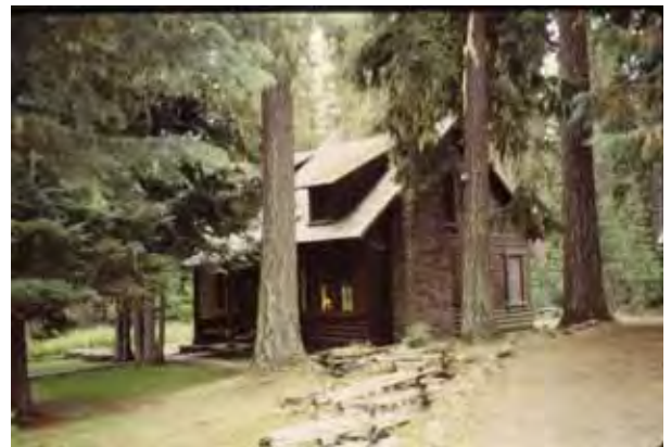
Clackamas Lake Historic Ranger Station ranger's residence is now a recreation rental.