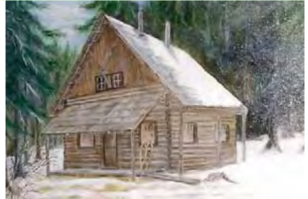
This painting of Ranger Graham's original Clackamas Lake Ranger Station cabin hangs in the visitor center in the historic ranger station office .

Editor's Note: Clackamas Lake Historic Ranger Station, about 75 miles southeast of Portland, is staffed by volunteers who operate the station's office building as a visitor center during the summer. To get there, take U.S. Highway 26, to its junction with Skyline Road (Forest Road 42) about 11 miles east of Government Camp and 5 miles west of the Warm Springs Indian Reservation-Mt. Hood National Forest boundary. Turn south onto Skyline Road and follow this paved road for 11 miles past its intersection with Forest Road 57 and the Clackamas Lake Historic Area sign. The historic Clackamas Lake Ranger Station office—which serves as the visitor center—is on the left, ¼ mile past the junction. The ranger's residence is on the east side of the road across from the office.