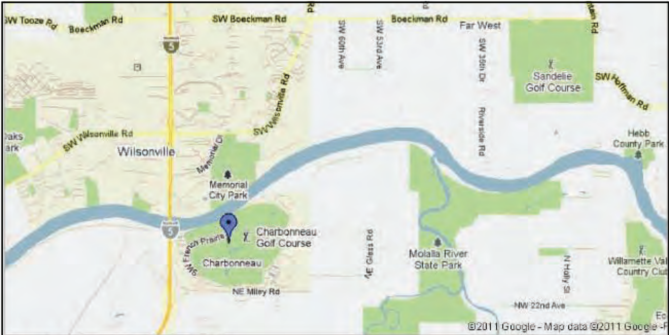
Spring Banquet, Charbonneau .....May 15, 2011 Spring Banquet at Charbonneau Country Club