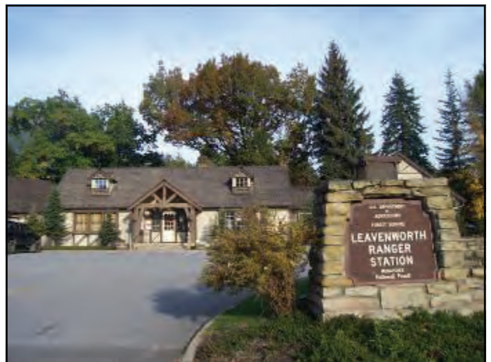
The historic Leavenworth Ranger Station office today.