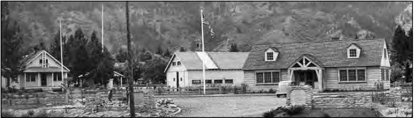
The old and the new office buildings at Leavenworth Ranger Station in 1939. The 1920s office on the left was replaced by the late 1930s Cascadian Rustic style office, flanked by other structures, on the right.